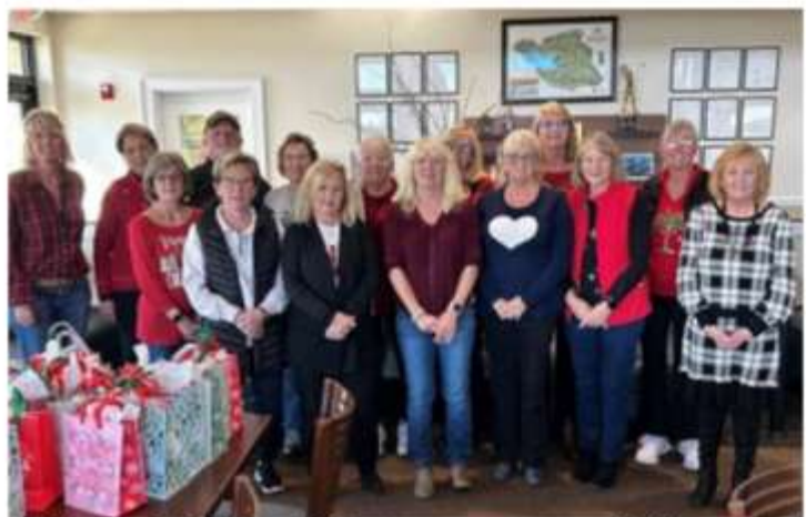
(Some of the wonderful Rose Volunteers at our annual Christmas luncheon)